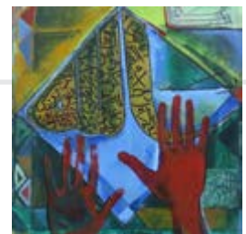
This Month's Cover Art